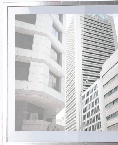
Shown: CS092FRSNL27 (7) PD092FRSNL2 Gracie Frost Pendants on Cluster 7 Canopy