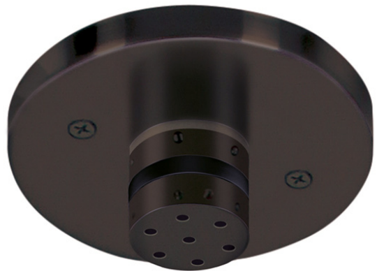
BZ: Bronze Finish