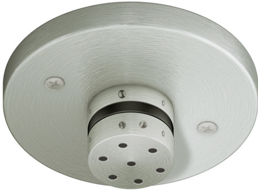
SN: Satin Nickel Finish