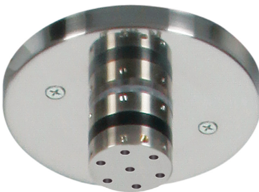
PN: Polished Nickel Finish