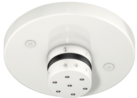
WH: White Finish